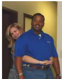
The proper procedure for the Heimlich maneuver is demonstrated.

Building on Site Tech's commitment to jobsite safety at all levels of our construction teams, CPR training and certification classes were recently conducted for Site Tech's field management staff. Through the use of video, lecture and hands-on training with CPR mannequins, the group learned valuable life-saving skills and received CPR Certification from the American Heart Association.