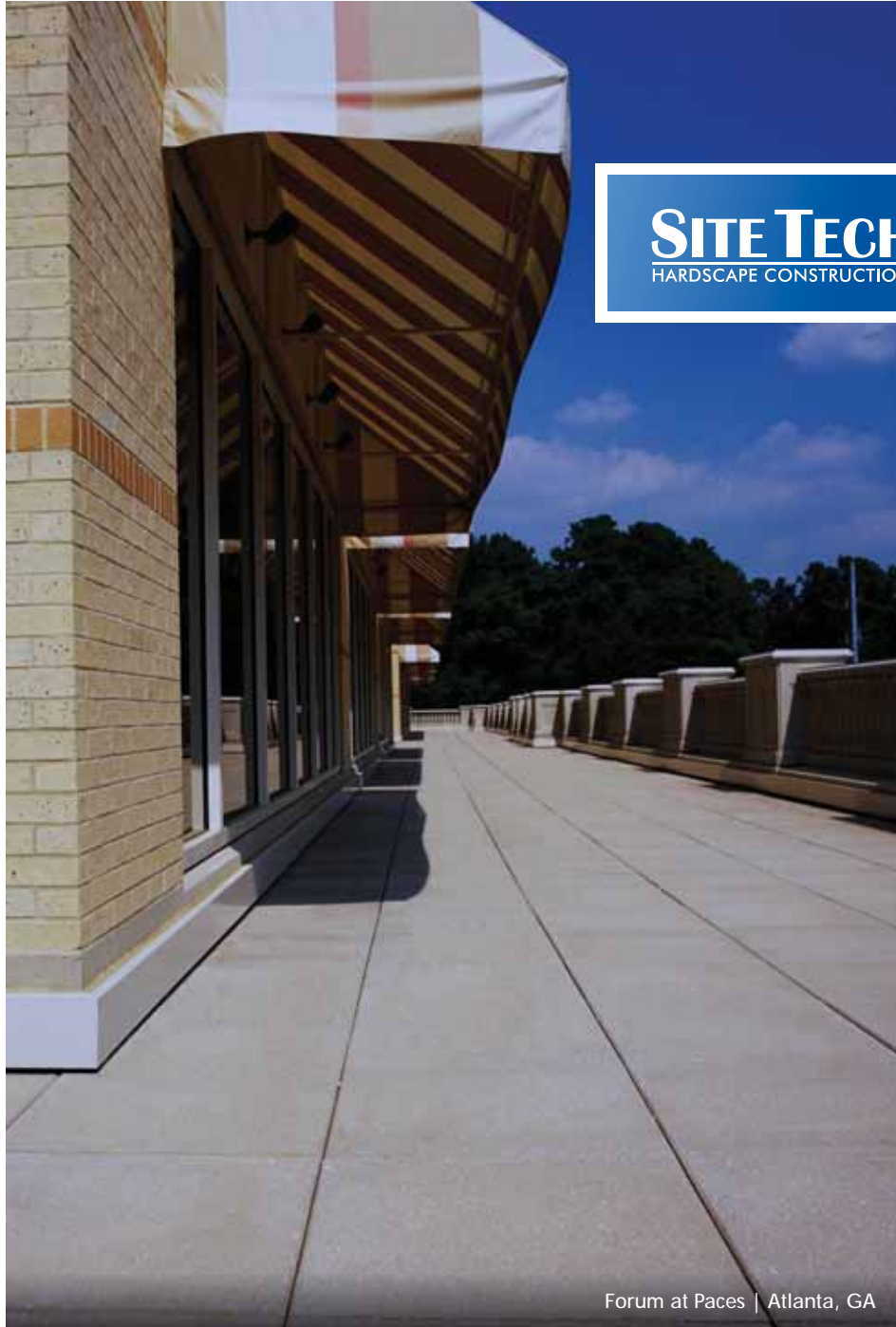
Forum at Paces | Atlanta, GA