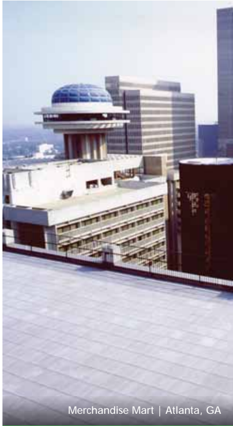
Merchandise Mart | Atlanta, GA