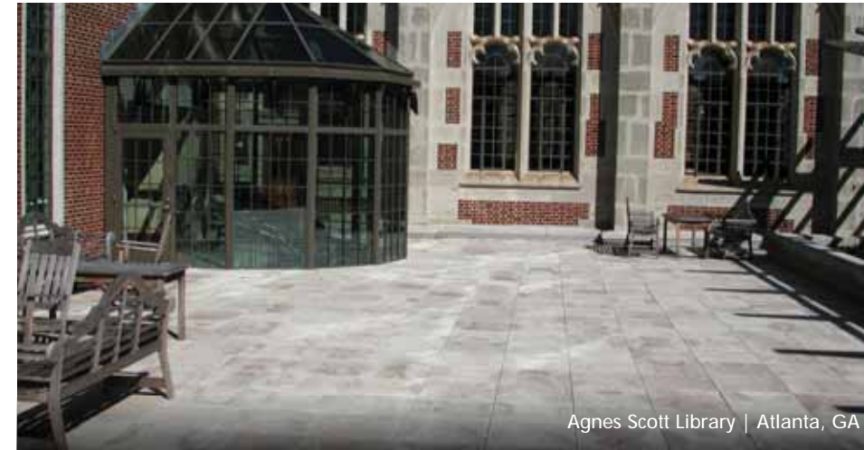
Agnes Scott Library | Atlanta, GA