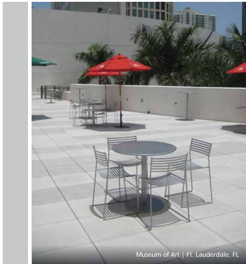
Museum of Art | Ft. Lauderdale, FL