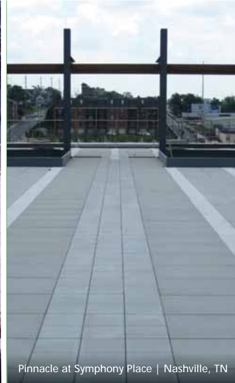
Pinnacle at Symphony Place | Nashville, TN