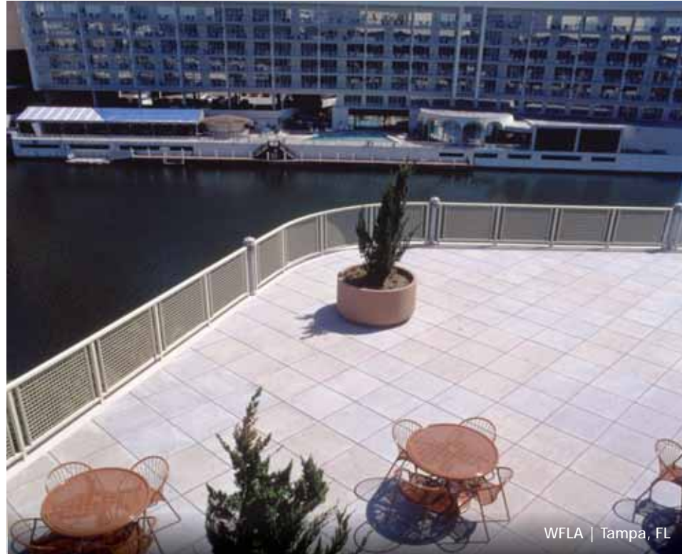
WFLA | Tampa, FL