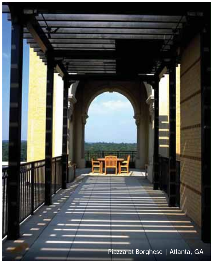
Piazza at Borghese | Atlanta, GA