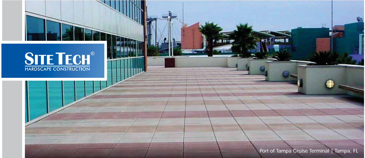
Port of Tampa Cruise Terminal | Tampa, FL